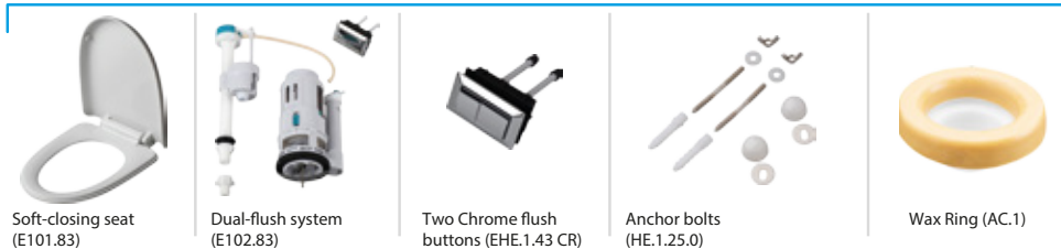
Soft-closing seat (E101.83)